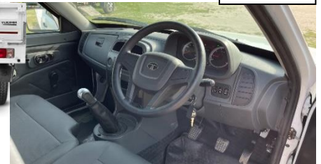
Basic Yodha Truck